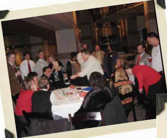
2008 Christmas Party