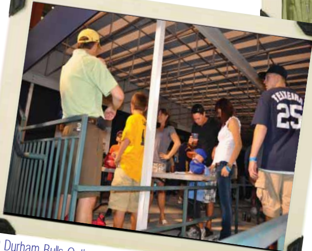
2009 Durham Bulls Outing