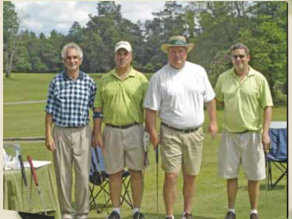
The 2009 RCA Golf Tournament Winning Team!